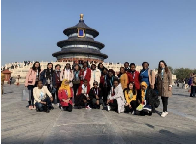
Visiting the Temple of Heaven

Teaching language is English. Classroom teaching will be the main teaching method, while incorporate a mix of lectures, seminars, case discussions, as well as practice inside and outside of classrooms.