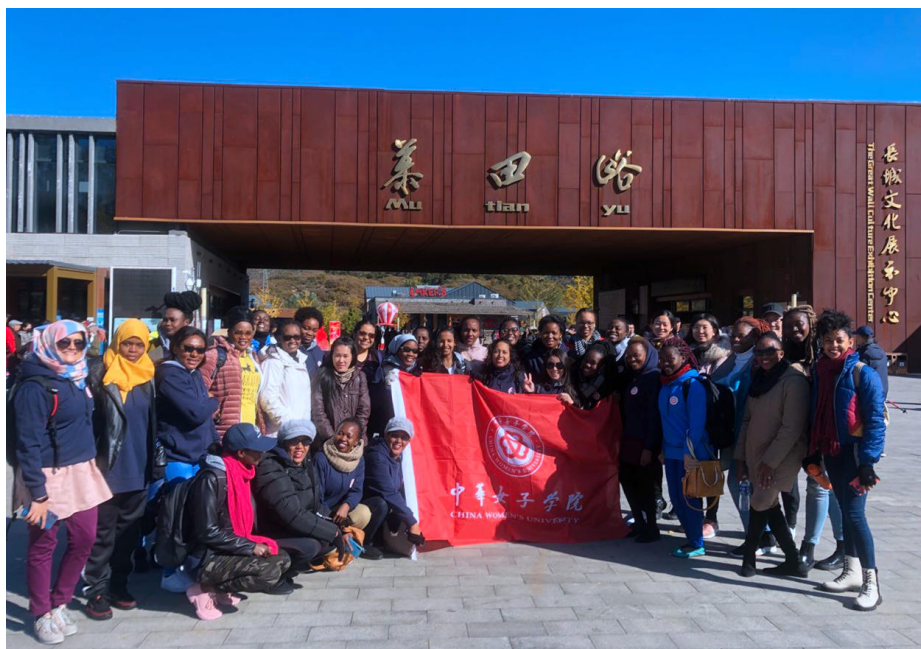
Visiting the Great Wall

Beijing has four distinct seasons, characterized by hot and humid summers, and generally cold and dry winters, meanwhile, springs and autumns are comfortable and pleasant. The average temperature in January is -3.7\text{ }^{\circ}\text{C} ( 25.3\text{ }^{\circ}\text{F} ), while 26.2\text{ }^{\circ}\text{C} ( 79.2\text{ }^{\circ}\text{F} ) in July. The cost of living in Beijing is a bit higher than most cities in China, with the food costs about 1200 yuan / month. Students are provided free single bedrooms in the international students' dormitory on the campus. Some of these rooms are equipped with private toilet and bathroom and will be assigned to new students by following the rule of 'first come first served'. Other facilities include public laundry, public kitchen 24-hour hot shower-water, and air conditioner and free Wi-Fi. Dormitory is accessible to students only.