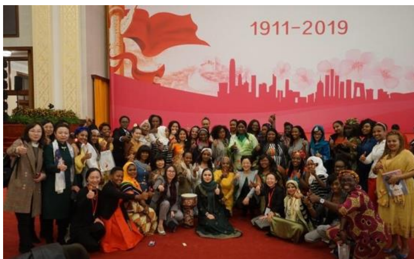
Reception of International Women's Day, Great Hall of the People

Ph.D., Professor of Law, specialized in women's property rights protection, civil law, women's law.