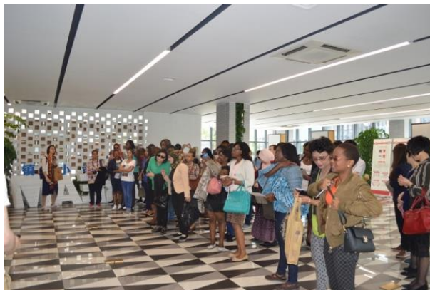
Fieldwork in Hangzhou Future City

Ph.D., Professor of Sociology, President of China Women's University, specialized in international communication, media and Women's Studies.