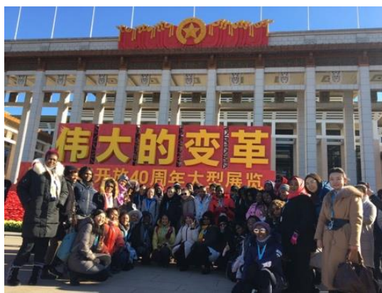
Understanding Chinese Experience

The courses' emphasis is laid upon applying interdisciplinary theories and multi perspectives of researching methods into practice, and let the students have a deeper understanding of gender and social development, women's leadership, as well as the theory and methods of women's participation in social development. The courses also aim at actively exploring the political and social factors hindering women from governance and decision-making. Theoretical studies will be combined with fieldwork and practices to effectively enable the students to better participate in government decision-making and governance. Students graduated from this program will possess both broad academic vision and solid professional basis to enhance their leadership capability, their ability to participate in government decision-making, as well as to advocate and encourage women's participation in social development in their home countries.