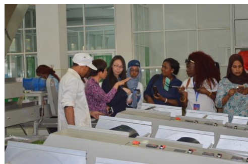
Fieldwork in Tea's Factory