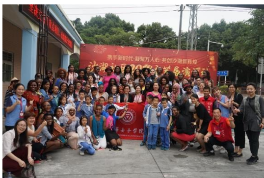
Fieldwork in Social Work Association

Ph.D., Professor of Social Work, former Chairperson of University Council of China Women's University, specialized in Gender Studies and family.