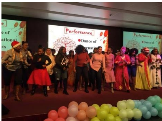
New Year Party

An International Master degree of Social Work (IMSW) will be conferred upon a candidate after her successful completion of required credits and her thesis approved by the University Academic Committee.