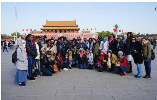
Tian An Men Square - The Heart of China

Professor of Law, Chairman of University Council of China Women's University, specialized in family inheritance law, women's human rights, women's law, civil law, etc.