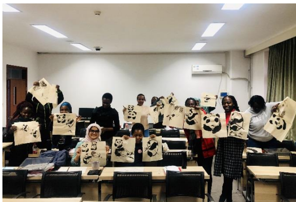
Experience Chinese Culture

Each academic year starts from September and ends in July. Thus, the two-year program includes two full autumn semesters, two full spring semesters, two winter vacations and one summer vacation.