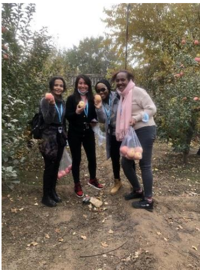
Picking up a Piece of Autumn

Assessment forms include course thesis statement, practice report and site report, etc. Credits are to be given only if the students pass the assessment in required courses. Thesis writing is to assess the students' capacity of integrating theories into their practice and policy analysis.